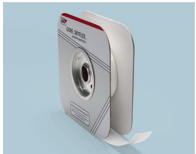
The 700 Series of GORE® SKYFLEX® Aerospace Tapes provides reliable environmental sealing & surface protection performance.