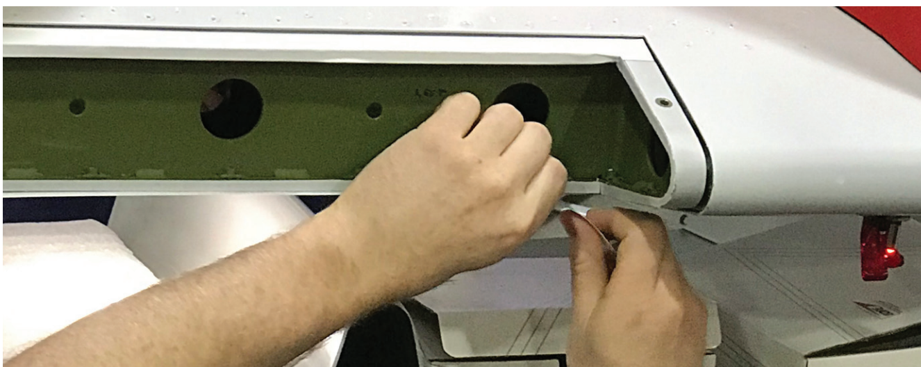
GORE® SKYFLEX® Aerospace Materials are faster and easier to install compared to FIP seals.

Gore's global team of application engineers work closely with you to help evaluate the parameters of your specific application and recommend the appropriate series of GORE® SKYFLEX® Aerospace Materials. We evaluate the material function, operating environment, and faying surfaces to determine compressive forces, gap tolerances, and required material properties. We also evaluate compression curves and our different material properties to determine the appropriate tape or gasket, form thickness, and adhesive for your application to ensure they perform as expected in real-world conditions.