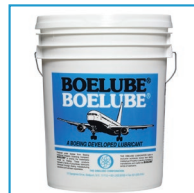
70104-05 (5 gal - 18.9 l)