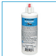
70104-L (4 oz - 118 ml)