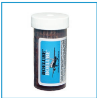
70104-HHL (4 oz - 118 ml)