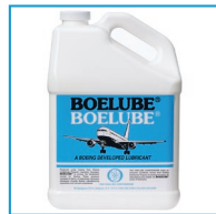
70104-04 (1 gal - 3.8 l)